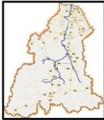
Fig 1. Map of the Kelantan rivers (Laporan Banjir Negeri Kelantan 2014)

span of 64 days. Moreover, Figure 1 shows that Kelantan Rivers was involved in more rainfall which leads flood of the downstream area of the Kelantan Rivers in December 2014.